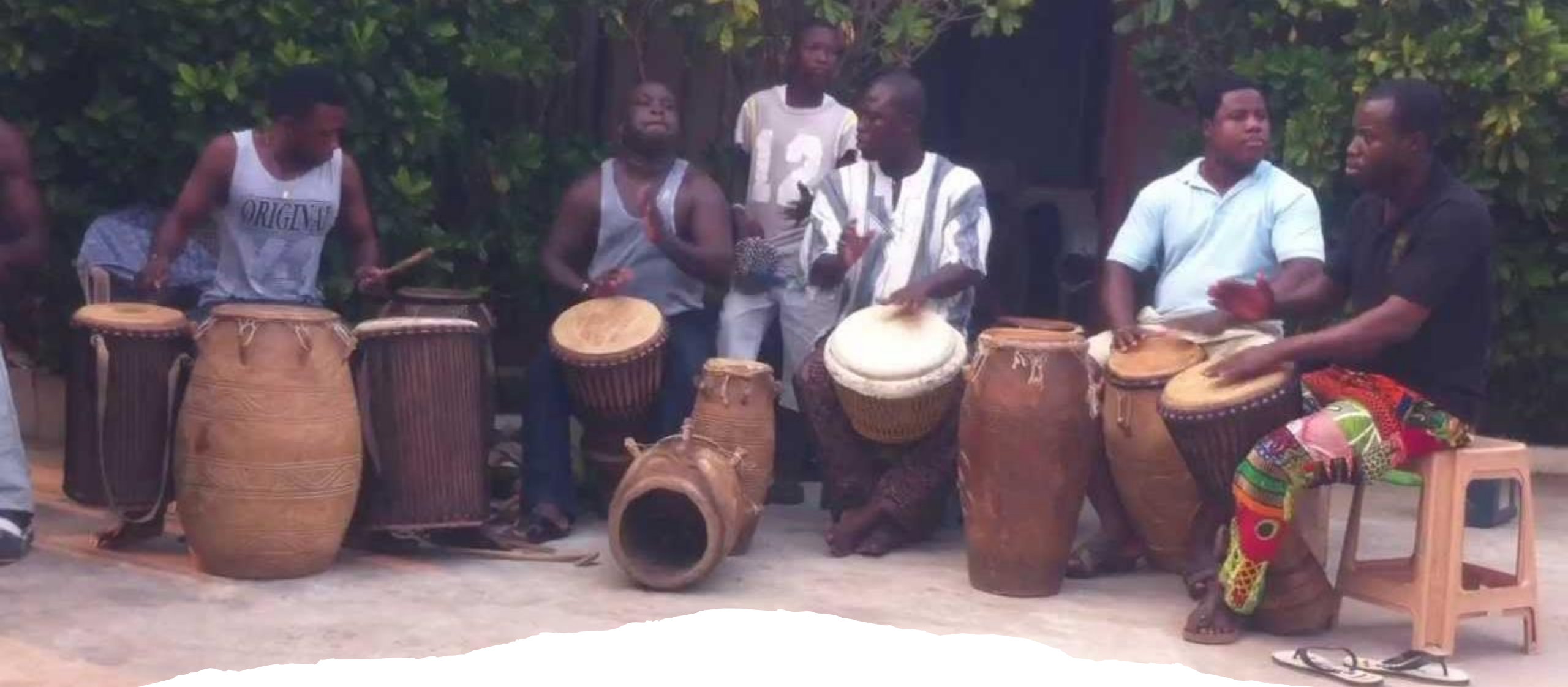
The West African Djembe